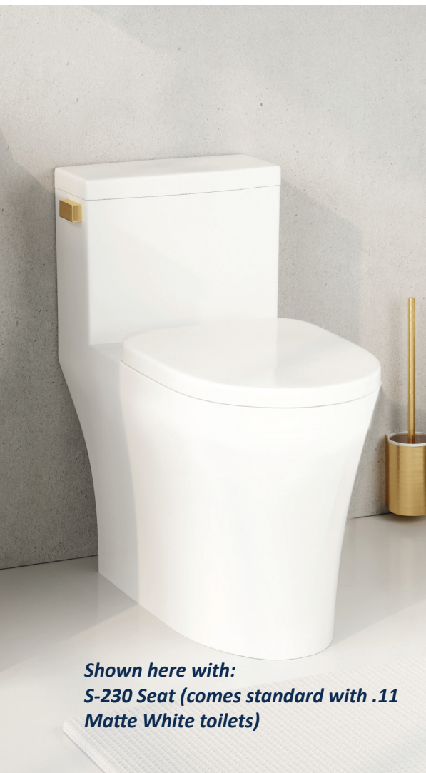
Shown here with: S-230 Seat (comes standard with .11 Matte White toilets)